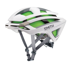
Smith Overtake Helmet White, L Competitive Cyclist $250.00