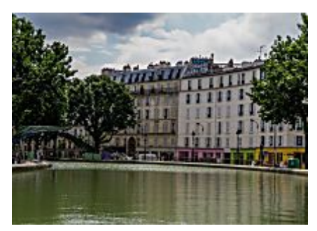
5 up-and-coming Parisian neighbourhoods - The Official Blog of...