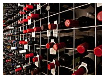
Solutions for a Smart Wine Cellar Mansion Global