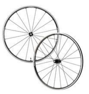
Shimano Ultegra 6800 Road Wheelset Chain Reaction Cycles