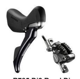
Shimano R785 Di2 Road Disc Brake